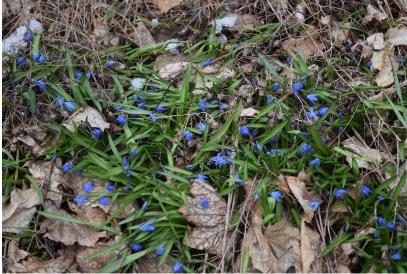
New Growth in one of our Hope Gardens