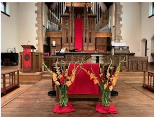
Pentecost reds on May 19!

Exactly what it sounds like...bring your Bible, your favorite brewed beverage, and a penchant for laid-back but totally engaging conversations about faith, scripture, and current events. We meet the 4 th Monday of each month from 6:30 p.m. to 8:00 p.m. Watch the Thursday Epistle for meeting location.