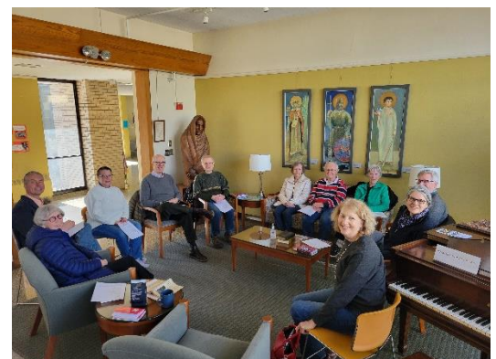
Benedictine Oblates who gather at Hope monthly